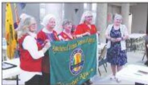
Members of the new Associates of Vietnam Veterans of America group are recognized Thursday at United Methodist Church in Poplar Bluff.