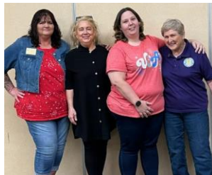
AVVA CA Officers Having Fun